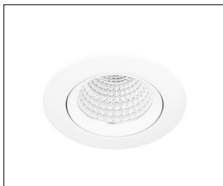
W White Trim