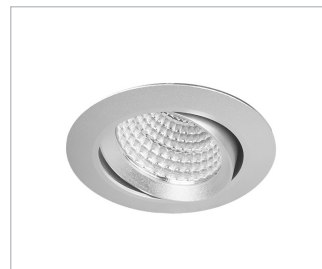
S Silver Trim