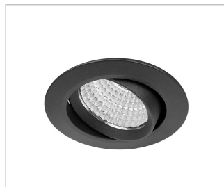
B Black Trim