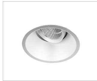
S Silver Trim