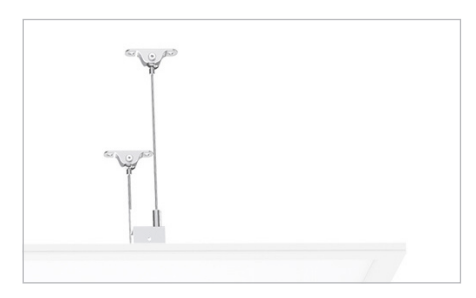
SP Suspension Kit