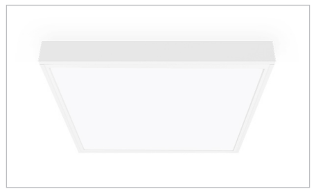
Surface Mounting Kit