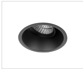
B Black Trim