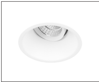
W White Trim