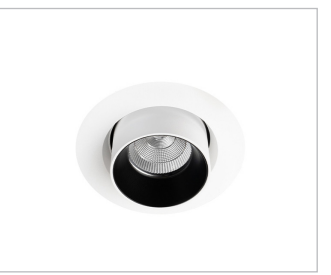
SI Silver In