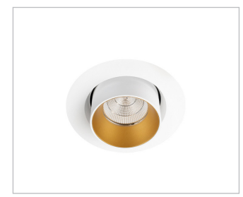
GI Gold Insert