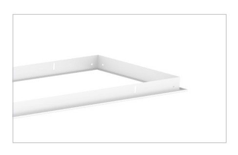
Plaster Recessing Kit