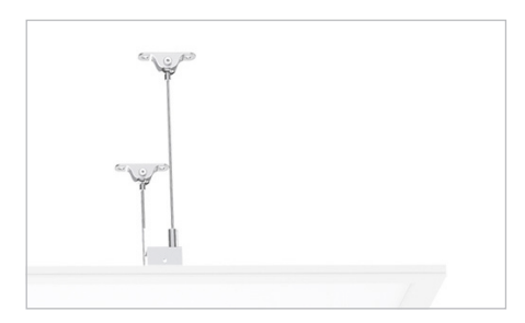
SP Suspension Kit