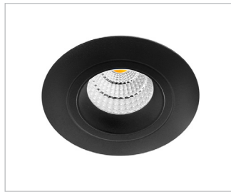
B Black Trim