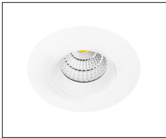
W White Trim