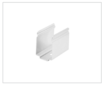
SSC Stainless Steel Clips