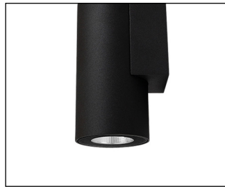
B Black Trim