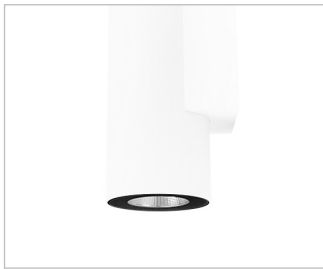
W White Trim