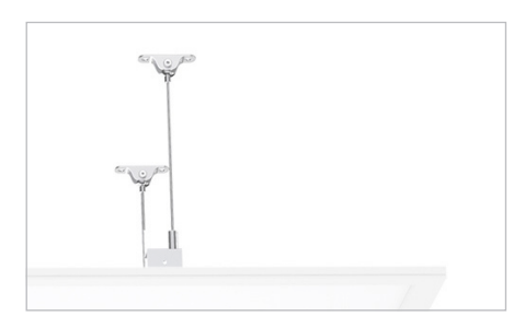
SP Suspension Kit