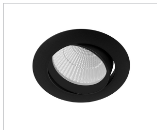
B Black Trim