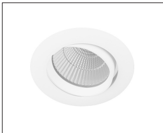
WI White Insert