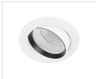
BI Black Insert