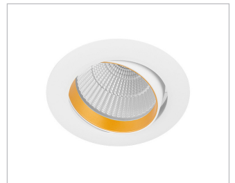
GI Gold Insert