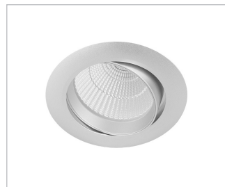
S Silver Trim