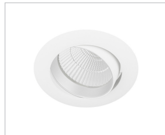
SI Silver Insert