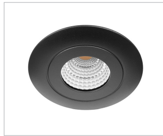
B Black Trim