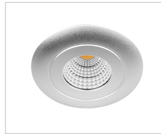
S Silver Trim