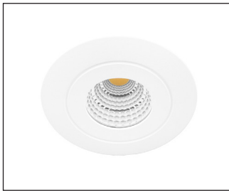
W White Trim