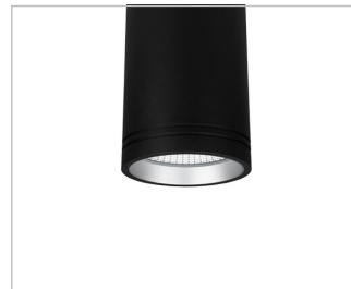
SI Silver Insert