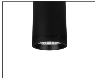
BI Black Insert