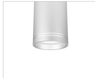
S Silver Trim