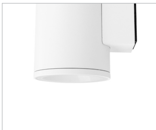
W White Trim