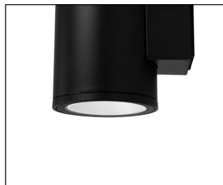
B Black Trim